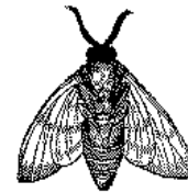
Figure 3: A sample black and white graphic that has been resized with the includegraphics command.

It is strongly recommended to use the package booktabs [15] and follow its main principles of typography with respect to tables: