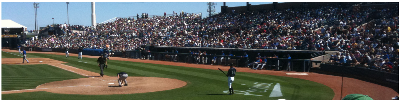
Figure 1: This is a teaser

The Kumquat Consortium jpkumquat@consortium.net